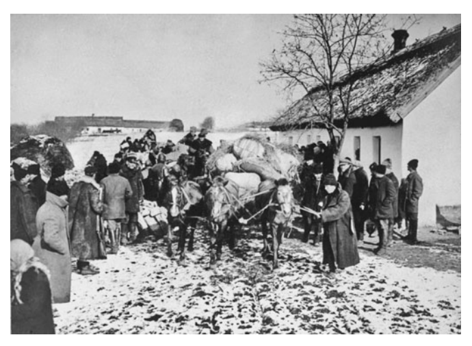
8. Evicting a kulak in Ukraine in 1930

resolution of the peasant problem. Rural areas were to be turned into nothing short of internal colonies to fund the Soviet great leap forward into industrial modernity. The kulaks were to be liquidated as a class', and individual peasants were to enter collectives. The results were cataclysmic. Almost two million peasants were exiled to inhospitable parts of Siberia and Kazakhstan in 1930–1 alone. Many others went straight into the rapidly expanding network of concentration camps (later known as the Gulag) that would remain an integral part of Soviet economic strategy until the mid-1950s. Non-kulaks were cajoled or coerced into collective farms.