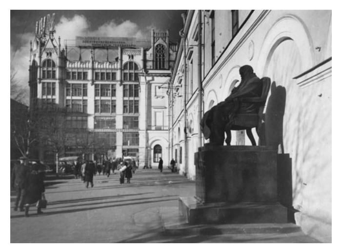
12. Shoppers approach Moscow's Central Department Store, the Mecca of Soviet consumerism, 1950s

and 1979 (which were years of bad harvests). Living standards were extremely modest by Western European standards, but until the late 1980s there was no significant downturn, and the Soviet population could enjoy a long period of unprecedented stability. Per capita consumption grew at an average annual rate of 3.5% between 1951 and 1980. The increase in discretionary income was also reflected in levels of savings, which rose from an average of 157 rubles per account in 1960 to 1,189 rubles in 1980.