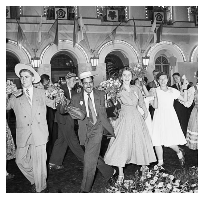
19. A scene of revelry from the World Youth Festival, Moscow, 1957

1,000 foreign correspondents). The authorities attempted to rein in the festivities: strenuous efforts were made to ensure public order and decorum, and law-enforcement professionals were supplemented by 20,000 Komsomol members for the duration. Notwithstanding their efforts, urban folklore alleged the existence of a distinct cohort of 'festival children' born of mixed capitalist/socialist liaisons. In reality, the demographic effects of the festival were not nearly so drastic, but its cultural impact remained considerable.