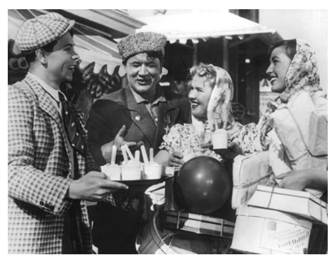
11. Consumer abundance in Cossacks of the Kuban

coup by becoming the first of the combatant nations to abolish rationing, this led to a short-term worsening of conditions for urban people, who until then had at least been able to procure some bread at guaranteed prices. The measure was accompanied by a currency reform that traded ten old rubles for one new ruble, thus wiping out savings. As always, however, the peasantry bore the brunt of Stalinist austerity. The average collective farm worker in 1945 received only 190 grams of cereals and 70 grams of potatoes for a day's toil. In 1946–7 came the last great famine of Soviet history: 1–1.5 million people died as a result of war damage, harvest failure, and the state's preference to fund reconstruction rather than keep people alive.