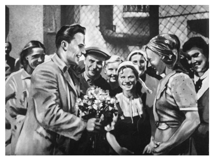
1. The heroine of The Radiant Path receives congratulations after a feat of record-breaking productivity

It is wise to be sceptical as to how warmly the forward-looking ethos was welcomed among the population. Many people, as secret