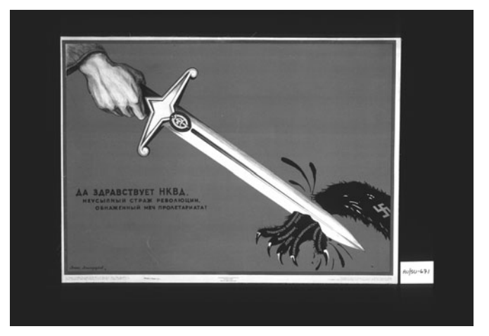
5. Poster 'Long Live the NKVD', 1939. Political violence is here depicted in terms reminiscent of a folk tale: as a struggle between righteous valour and bestial evil

to be at war – effectively against its own society, though it did not put it that way. The mindset was expressed early in 1933 by Nikolai Bukharin, a particularly valuable witness as he is sometimes considered to be the civilized face of Bolshevism and was to fall victim to the last of the major show trials of the 1930s: 'we must march onward, shoulder to shoulder, in battle formation, sweeping aside all vacillations with the utmost Bolshevik ruthlessness, hacking off all factions, which can only serve to reflect vacillations within the country'.