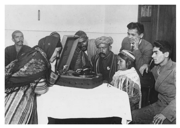
16. Tajik collective farm workers listening to the gramophone, Moscow 1935: a typical demonstration of the Soviet 'friendship of peoples'