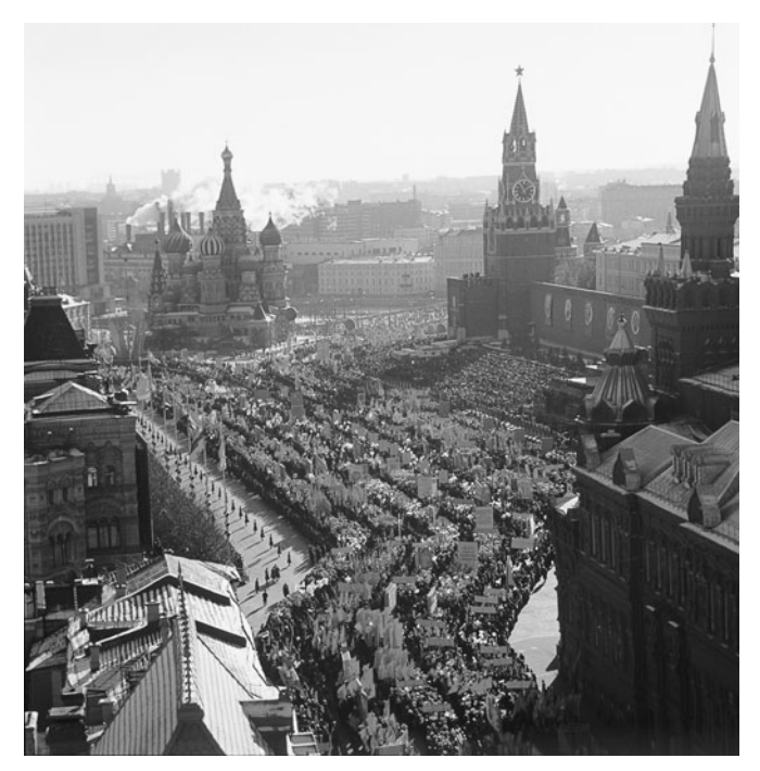
6. Revolution Day, Moscow, 7 November 1978. A key ritual of popular participation

The legitimacy of Soviet rule depended on constant manifestations of popular enthusiasm. Rituals of involvement included not only voting, but also parades, meetings, and even carnivals. Nor was participation to become merely a matter of routine. The authorities were constantly mobilizing people for new feats of endurance and dedication. By engaging in 'socialist competition', citizens could demonstrate their devotion to the cause and their sterling qualities. The 'campaign' was close to the standard mode of operation for Soviet people from the late 1920s to World War II and beyond.