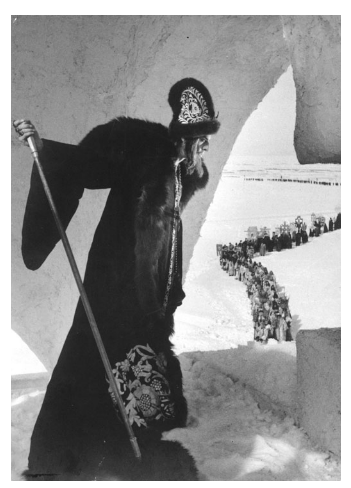
3. Scene from Ivan the Terrible : Ivan surveys his people marching to beg him to restore order in Muscovy

Soviet culture became overtly backward-looking in its search for moral succour at a time of emergency. Comparisons with the first Patriotic War – the campaign against Napoleon in 1812–14 – were a staple of war journalism. The struggle with Nazi Germany was