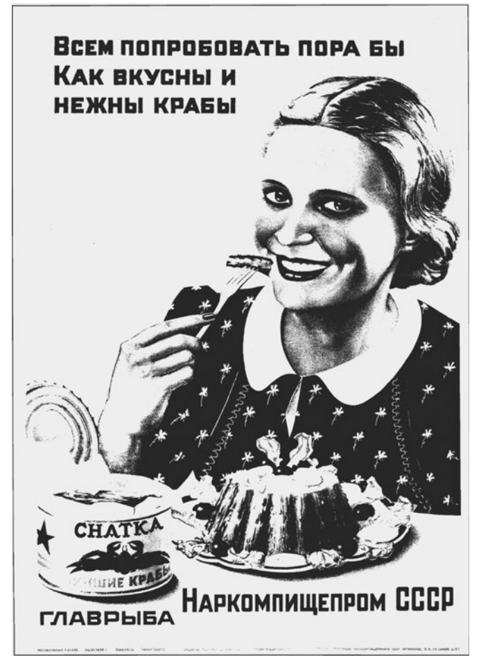
10. Advertisement for crab meat, 1938

described in loving detail. Anastas Mikoyan, People's Commissar for External and Internal Trade, acquired 22 hamburger machines on a visit to the USA in 1936. The Red October chocolate factory in Moscow produced 500 varieties of confectionery in 1937.