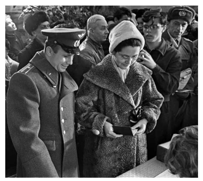
7. Space pilot Yuri Gagarin and his wife cast their votes in the election to the USSR Supreme Soviet, 1962

10 days of the party plenum that had announced the initiative, almost 25,000 volunteers had been despatched. The total Komsomol recruitment over the period 1954–60 was more than 360,000. Between 1954 and 1958, the Virgin Landers took over 40 million hectares of uncultivated land and raised grain production in the USSR by more than one-third.