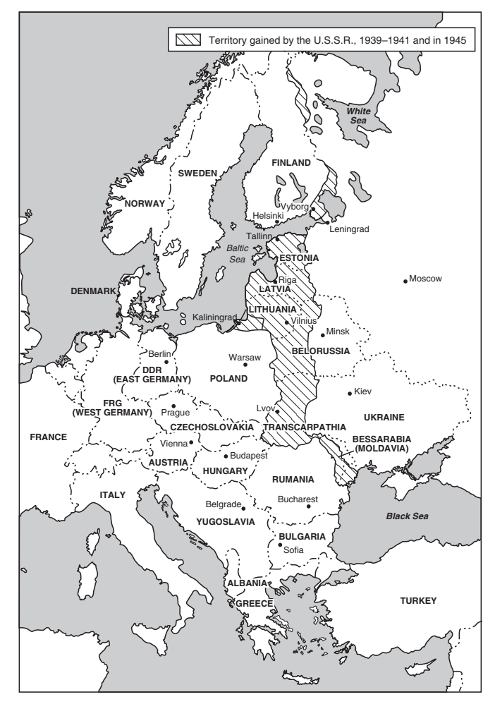
Map 2. The USSR and Europe at the end of World War II