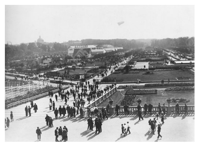
14. A view of Gorky Park in the mid-1930s. This park was a showcase for 'cultured' leisure in the Stalin era

the imbibing of approved Soviet knowledge but also the adoption of the appropriate lifestyle. Curtains, lampshades, and tablecloths were now de rigueur for the civilized Soviet household – even if that was only a partitioned corner of a room. Fashionable clothes, cosmetics, and perfumes became publicly respectable, even desirable, in the second half of the 1930s. On a more prosaic level, the norms of 'culturedness' required the Soviet person to be clean and well groomed and to change his or her underwear regularly. This mixed bag of lifestyle recommendations constituted a package of what in other countries would have been called 'middle-class values'. It had little in common with the proletarian austerity of earlier phases of Soviet history.